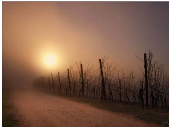
Photo 1. Center the photo if it is not page-width. The caption below the photo should be the same width as the photo